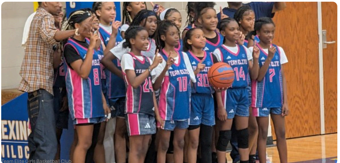
Team Elite Girls Basketball Club

Sponsorship funds directly reduce the financial burden on families.