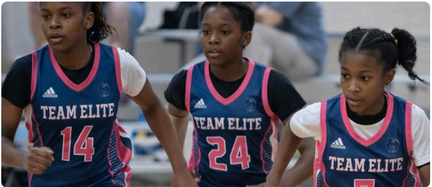
Team Elite Girls Basketball Club

We work with you to create a partnership that aligns with your brand and goals.