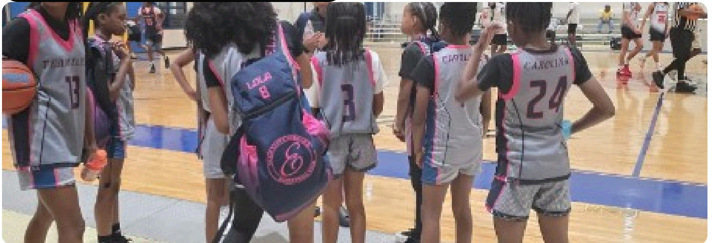
Team Elite Girls Basketball Club

Families remember and reward businesses that invest in their children's futures.